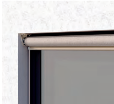
S4110 No box