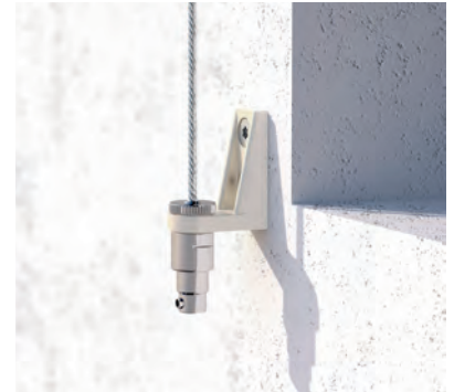
Wall bracket incl. spring chuck