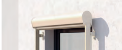
VS4300 Square or round box