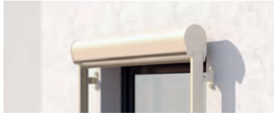
VS4300 Square or round box