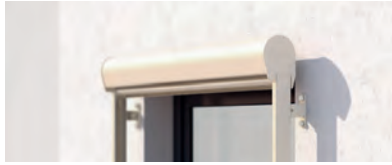
VS4300 Square or round box