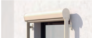
VS4300 Square or round box