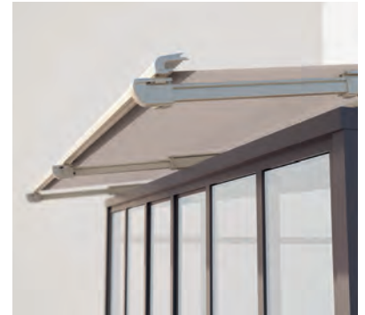
PS6100 Extending projection