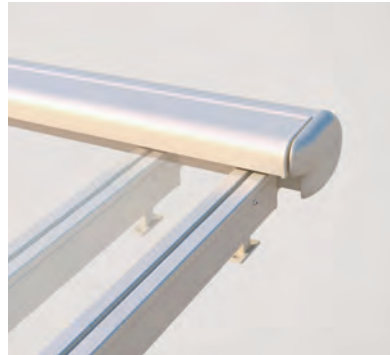
Adjustable guide rails